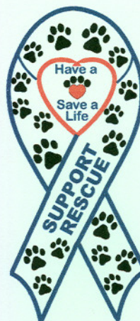
Rescue Ribbon sample design. Actual design varies, depending on supply

We are still offering Rescue Ribbon or Round car magnets. The exact design varies with our suppliers' inventory. To order a magnet at $10 plus $1 for postage, contact Arlene Robbins at ars-pets@swbell.net .