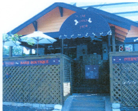
Entrance to The Pooch Patio, located on the side of the main building.

This month's meeting is very important because it is time to elect offi-